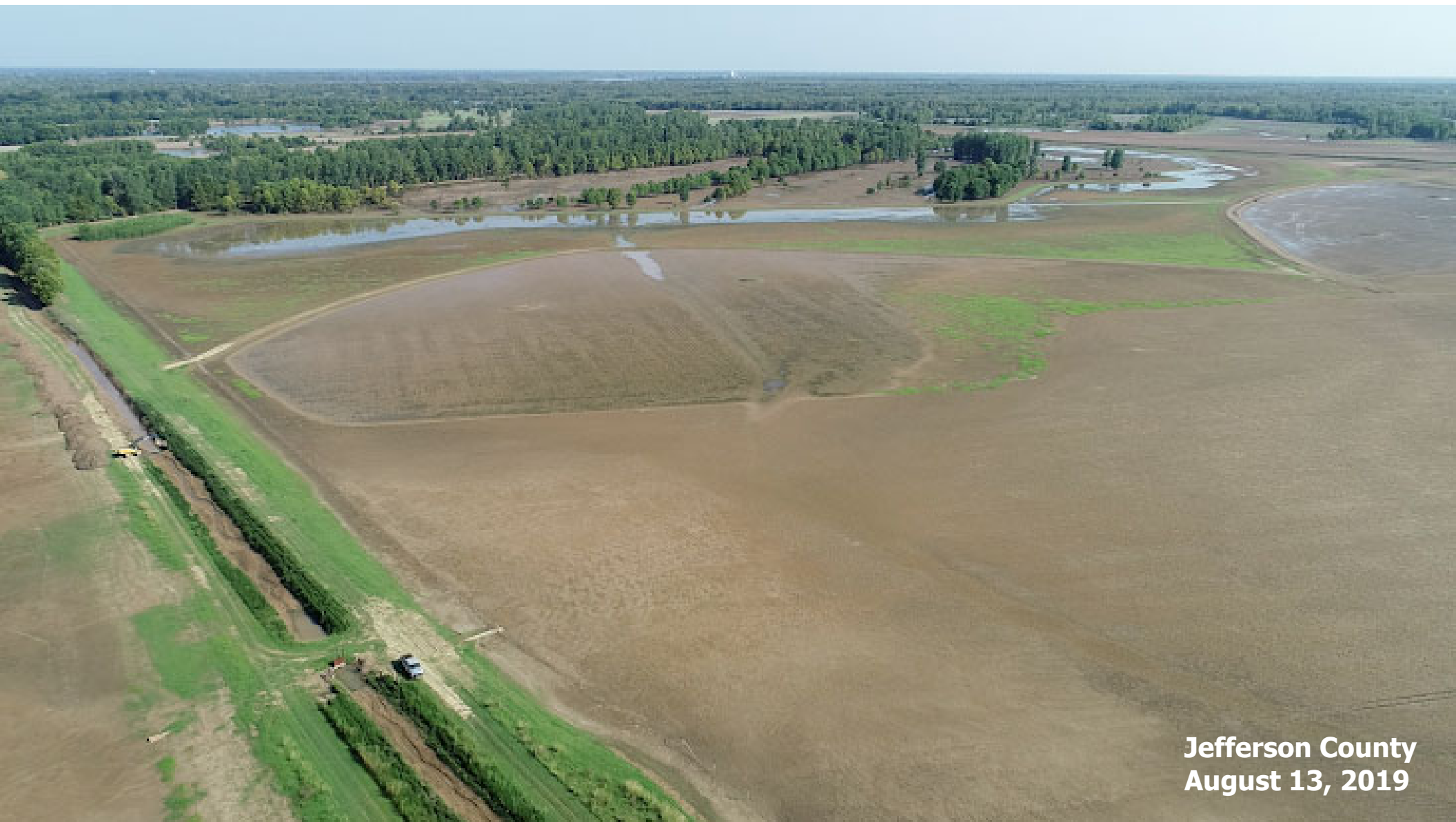
Jefferson County August 13, 2019