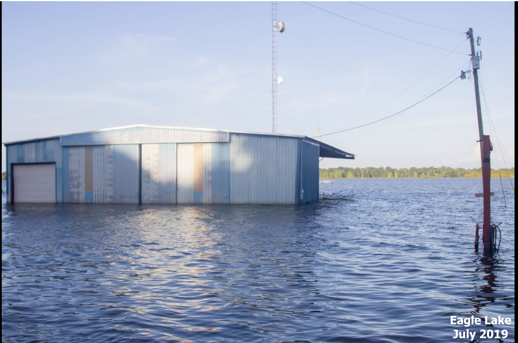
Eagle Lake July 2019