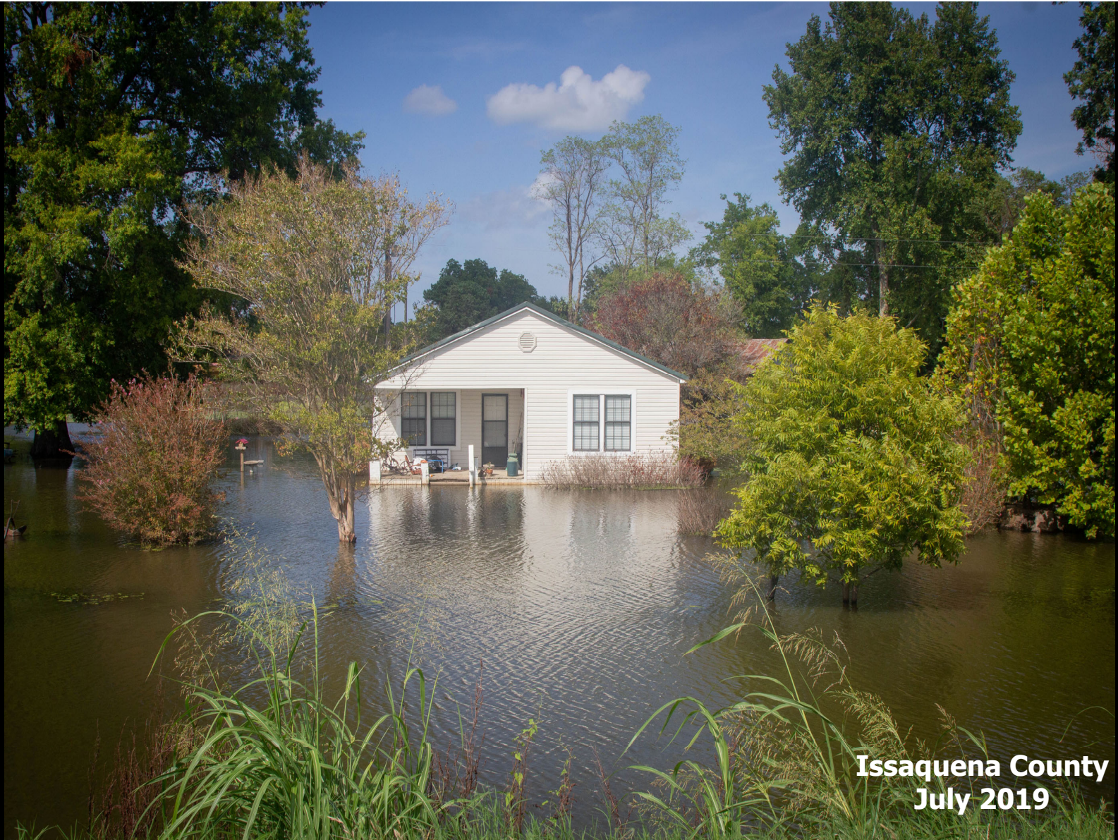
Issaquena County July 2019