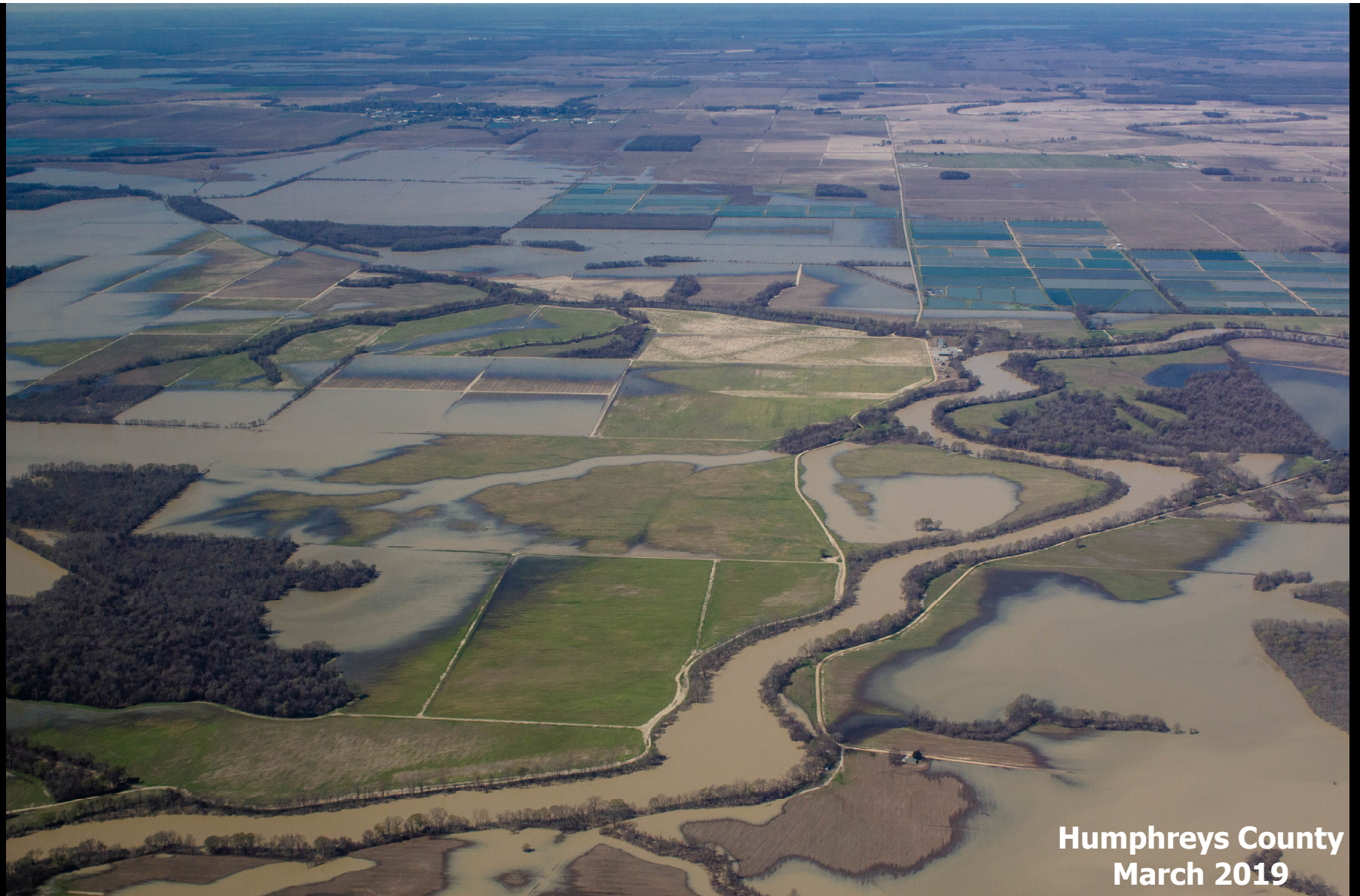
Humphreys County March 2019