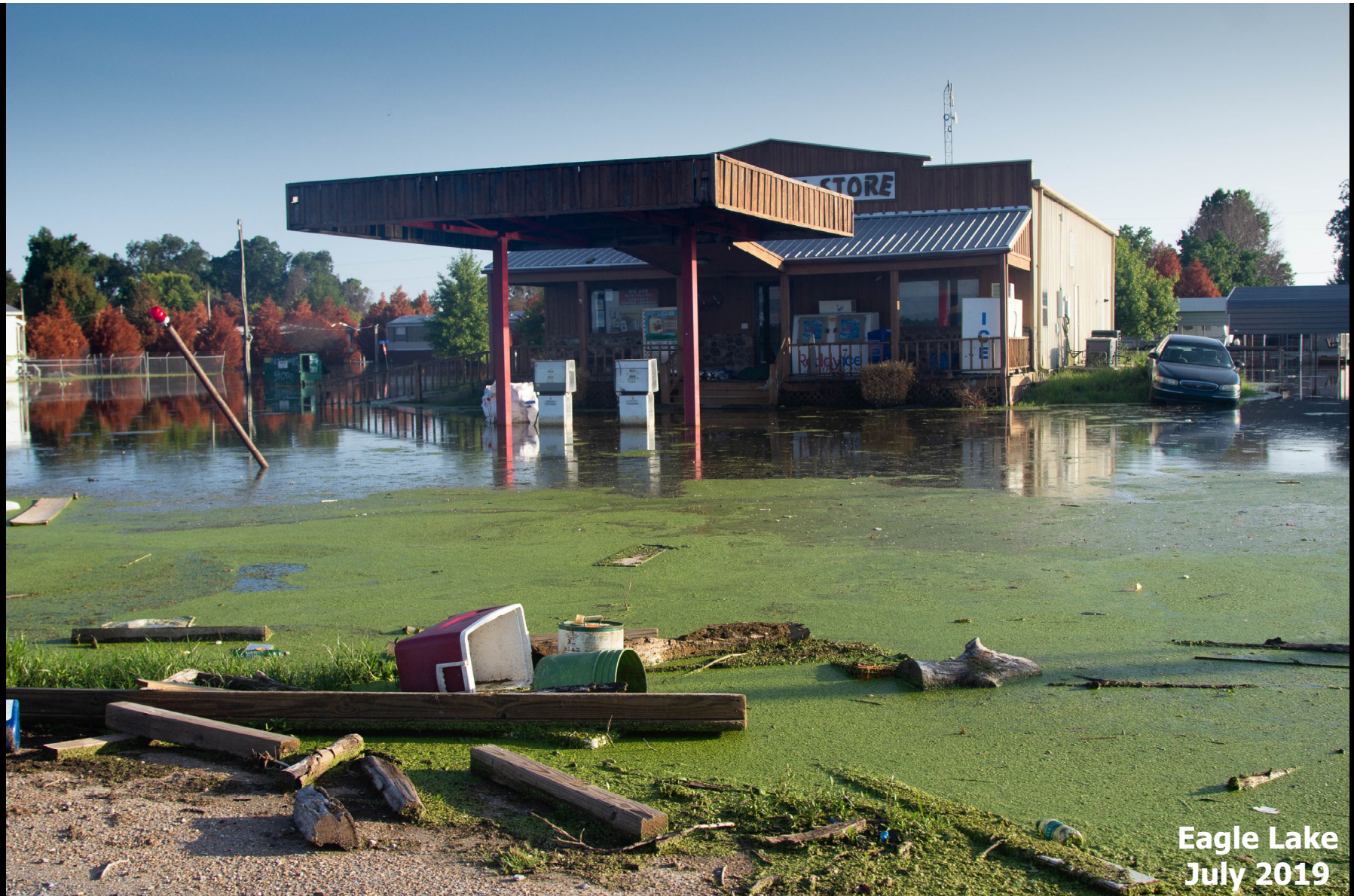
Eagle Lake July 2019