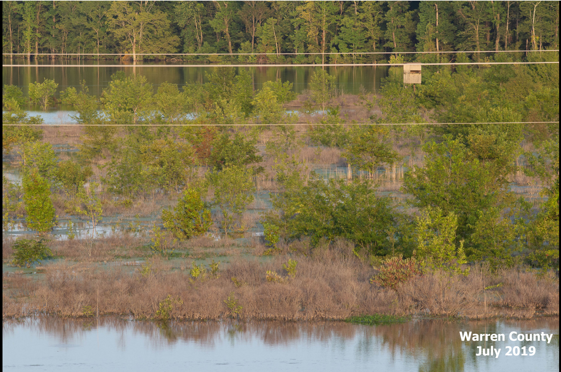
Warren County July 2019